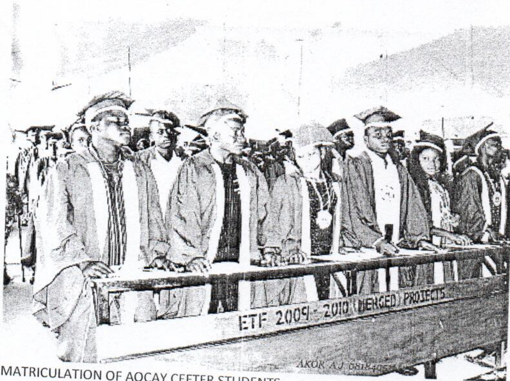
MATRICULATION OF AOCAY CEFTER STUDENTS