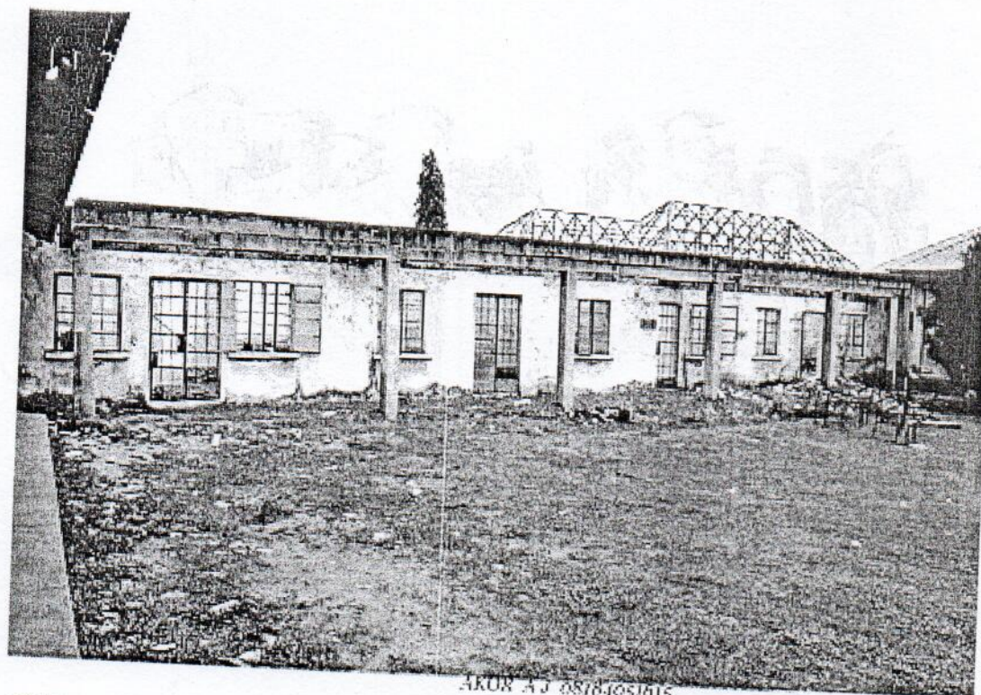
RENOVATION OF CEFTER BLOCK